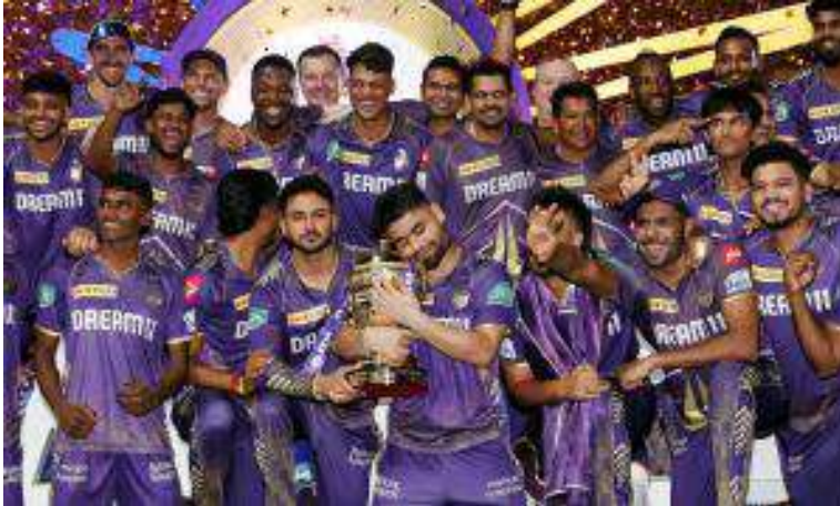
Kolkata Knight Riders (KKR)

2. Which country named the cyclonic storm 'Remal' that recently hit the Bay of Bengal?