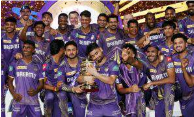
Kolkata Knight Riders (KKR)

2. Which country named the cyclonic storm 'Remal' that recently hit the Bay of Bengal?