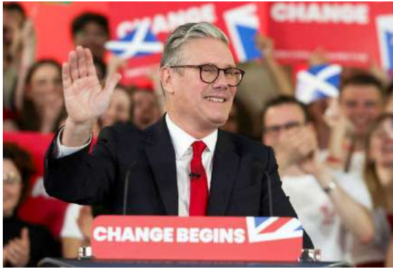
Keir Starmer speaks at a reception to celebrate Labour's win at the Tate Modern in London, July 5, 2024.

Q-5. T-20 ICICI world Cup Championship-2024 won by India. Name the country to whom India beat to win this world cup?