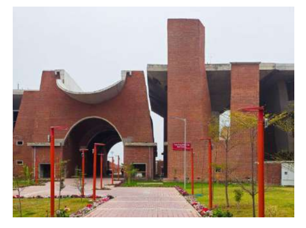
Ans: The new campus of Nalanda University at Rajgir in Bihar.

Q-7- Identify the monument visited by the Prime Minister in June.